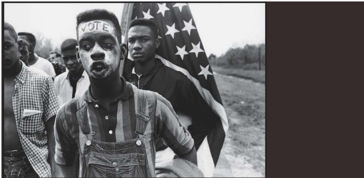
A demonstrator at the 1965 march from Selma to Montgomery, led by the Rev. Dr. Martin Luther King Jr. to fight for black suffrage.

But it would be historically inaccurate to reduce the contributions of black people to the vast material wealth created by our bondage. Black Americans have also been, and continue to be, foundational to the idea of American freedom. More than any other group in this country’s history, we have served, generation after generation, in an overlooked but vital role: It is we who have been the perfecters of this democracy.