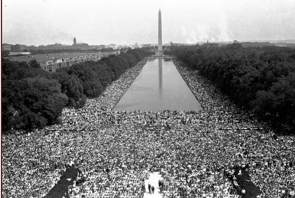
The March on Washington for civil rights, 1963.

No one cherishes freedom more than those who have not had it. And to this day, black Americans, more than any other group, embrace the democratic ideals of a common good. We are the most likely to support programs like universal health care and a higher minimum wage, and to oppose programs that harm the most vulnerable. For instance, black Americans suffer the most from violent crime, yet we are the most opposed to capital punishment. Our unemployment rate is nearly twice that of white Americans, yet we are still the most likely of all groups to say this nation should take in refugees.